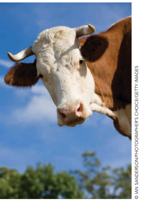
"WILL THE MARKET PROTECT ME?"

Within the United States, various laws aim to protect fish and other wildlife. For example, the government charges for fishing and hunting licenses, and it restricts the lengths of the fishing and hunting seasons. Fishermen are often required to throw back small fish, and hunters can kill only a limited number of animals. All these laws reduce the use of a common resource and help maintain animal populations.