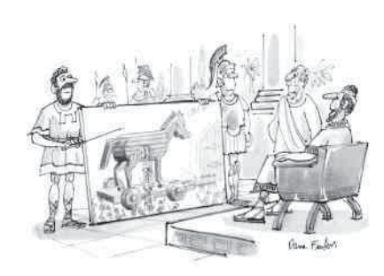
"I LIKE THE CONCEPT IF WE CAN DO IT WITH NO NEW TAXES."

Economists disagree among themselves about what role the government should play in fighting poverty. Although we discuss this debate more fully in Chapter 20, here we note one important argument: Advocates of antipoverty programs claim that fighting poverty is a public good. Even if everyone prefers living in a society without poverty, fighting poverty is not a "good" that private actions will adequately provide.